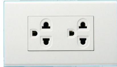
(A, B, & C Compatible)